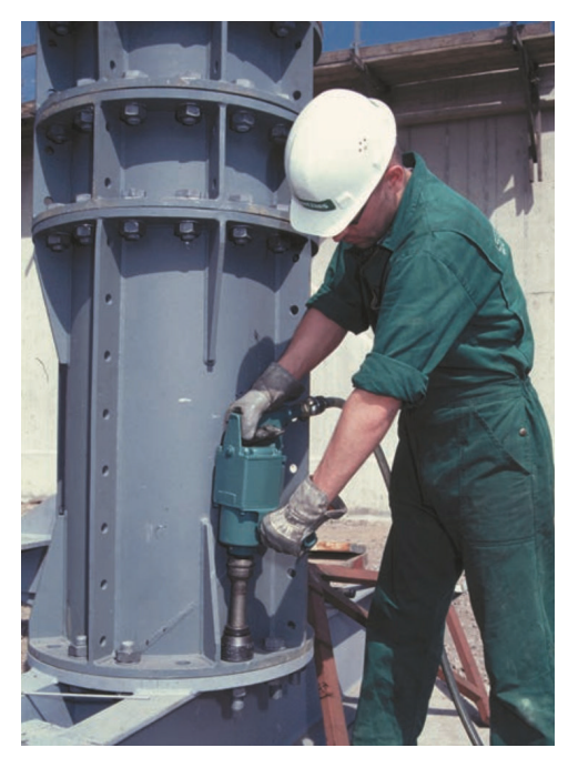
3/4" Drive Hydraulic Impact Wrench